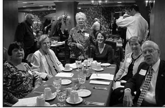
Westminster Presbyterian Church volunteers.