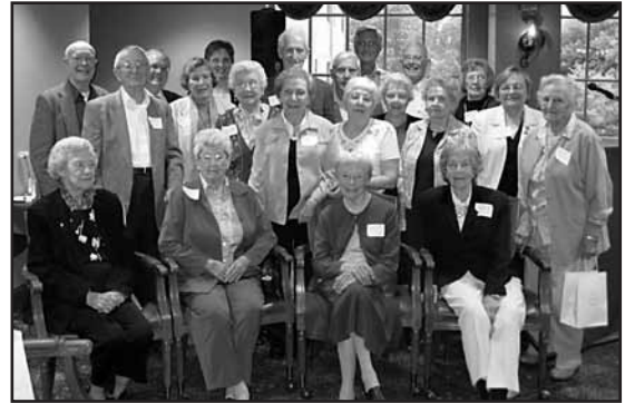
Meals on Wheels 20+ years volunteers and Senior Services of Alexandria board members.