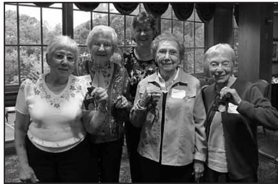
Our heroes - volunteers who have delivered meals for over 20 years.

Over 100 Meals on Wheels volunteers were honored at a luncheon hosted by The Washington House on October 14. It was a rare occasion to find this group, who are usually delivering meals throughout the city, all in one place enjoying a meal together.