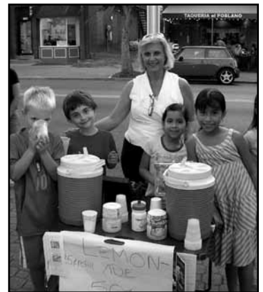
Youth attending Del Ray's First Thursday on Sept. 4 provided "lemonade" for participants. Proceeds from the sale were donated to Senior Services of Alexandria.