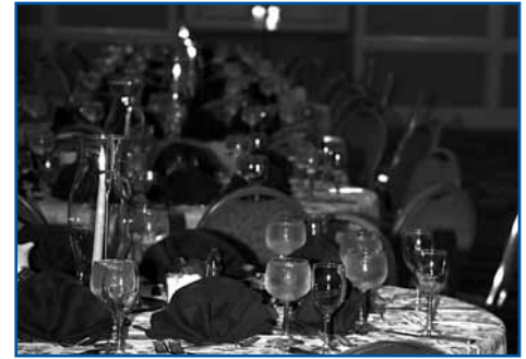
“Generation to Generation” Gala 2009”

Visit seniorservicesalex.org or call 703 836-4414 for more information about the Gala tickets and sponsor opportunities.