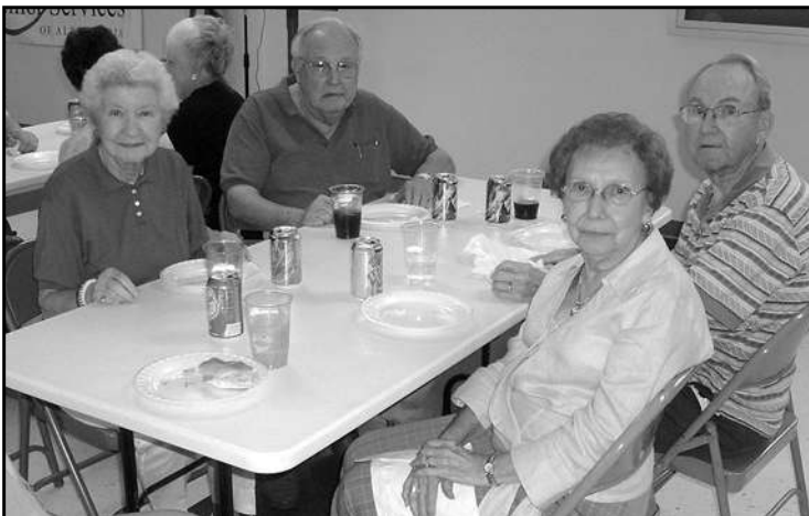
Some of the many Volunteers who attended the August 17th “Meals on Wheels Volunteer Recognition Event at “St. Joseph’s Church!”